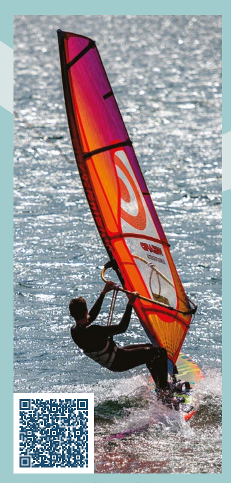
Scan the QR code and discover all the experiences to be enjoyed on the lake!

You can also try SPORT FISHING , book a comfortable BOAT TOUR , climb aboard a boat to explore the shores of Lake Como and visit the most beautiful villages, or rent a boat just for you, to spend a day of fun that is very much out of the ordinary!